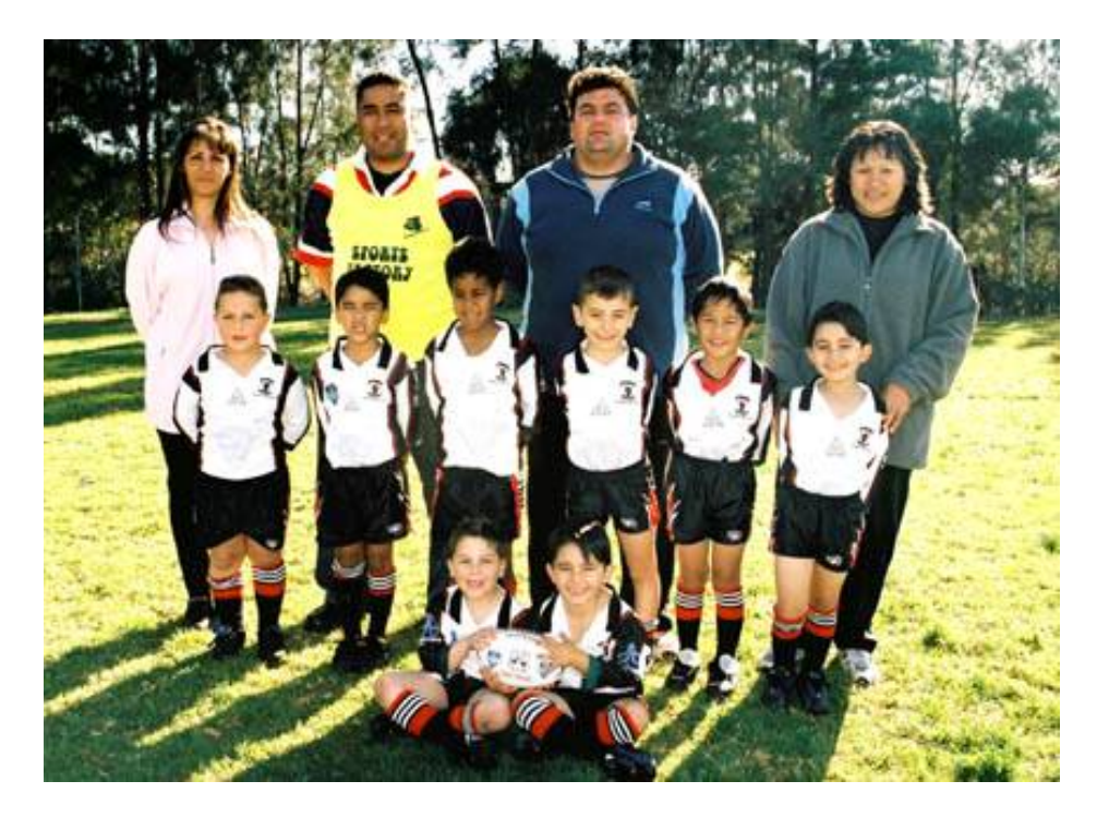
Under 6's (The Mighty Midgets) of 2004