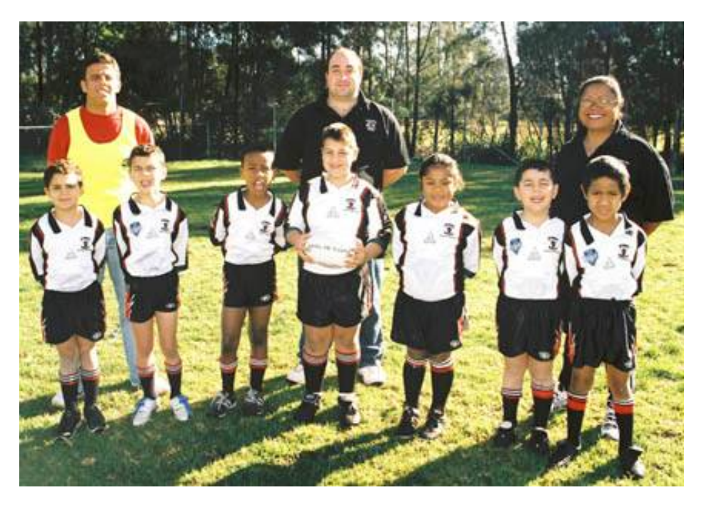
Under 7's 2004

Casablanca Holiday Apartments "On Kings Beach" Caloundra Phone Joyce for a reservation on 07-5491-4323 today